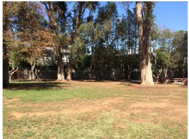
Grove Proposed for New Picnic Area