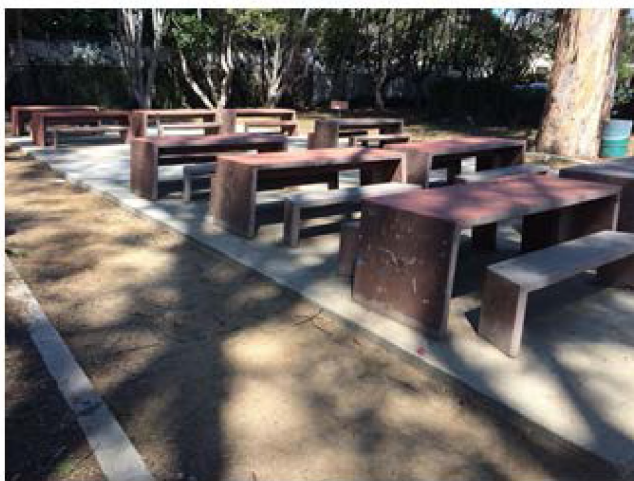
Existing Picnic Area and Concrete Slab