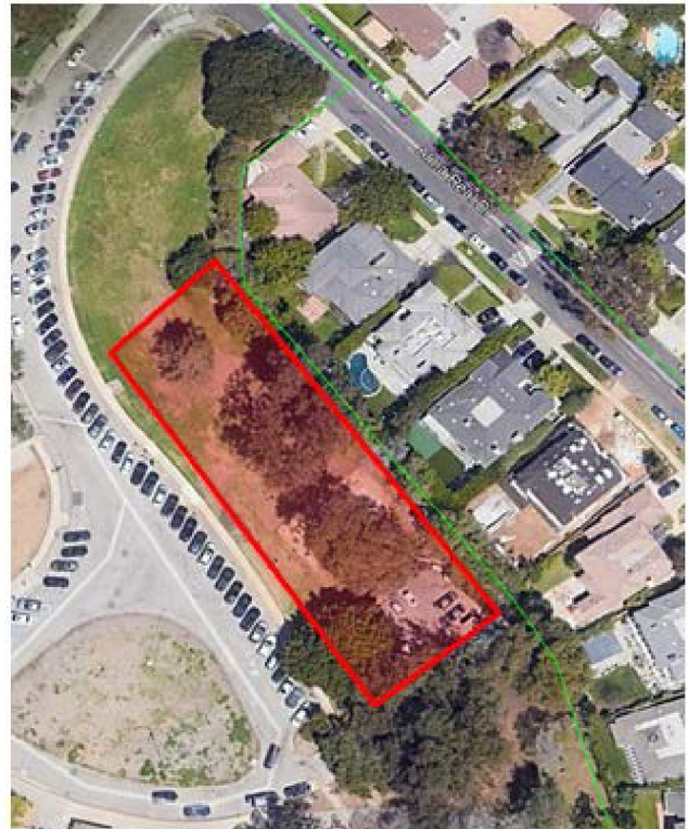
Project Approximate Location